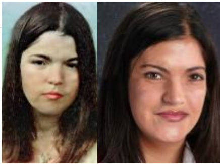
Original and age enhanced.